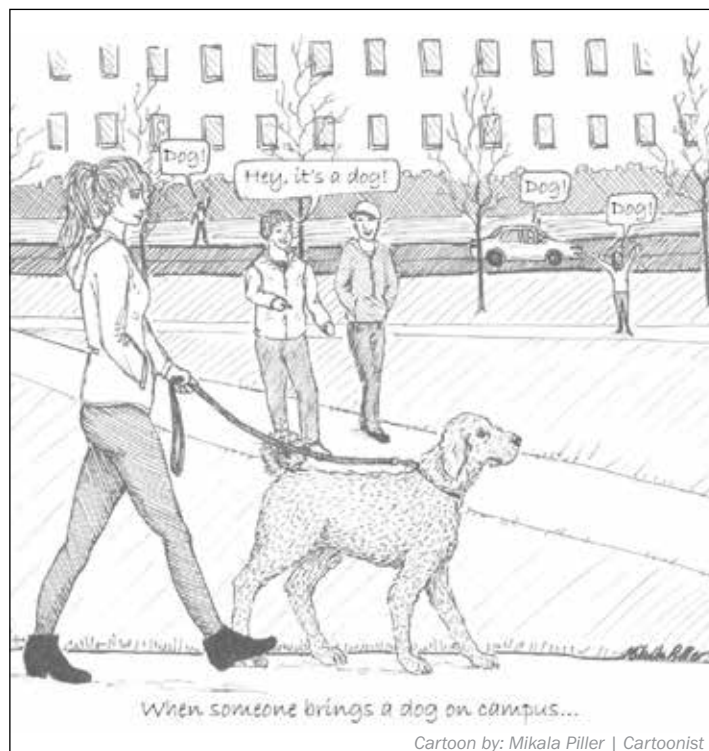
When someone brings a dog on campus...

One day at a time, Bulldogs. Just one day at a time.