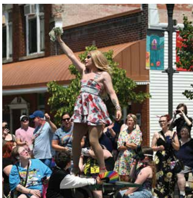
Drag performance from the 2025 Big Rapids